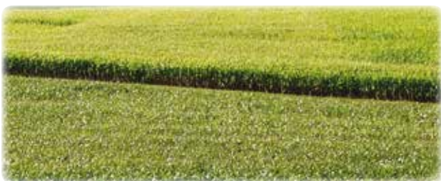
Molecular view of corn leaves